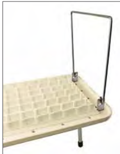
Handle and Leg Kit Shown on Removable Tray